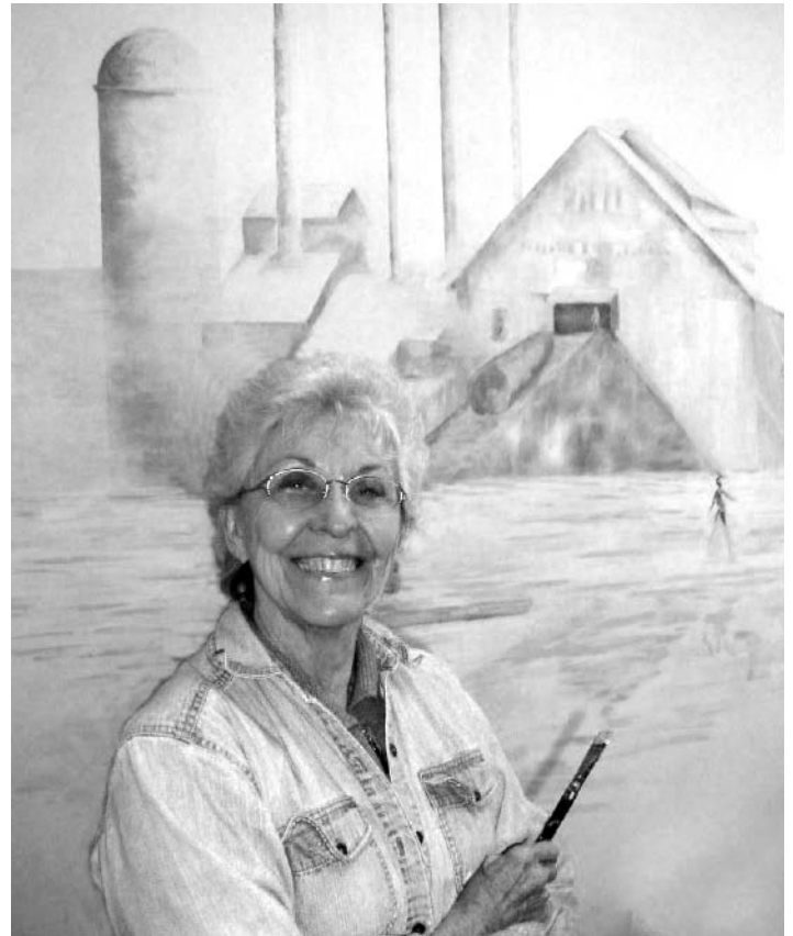
CSAC's new Volunteer Coordinator and her unfinished mural at the Tuolumne Museum in Tuolumne.

Check our website for information on more ways to get involved at CSAC!